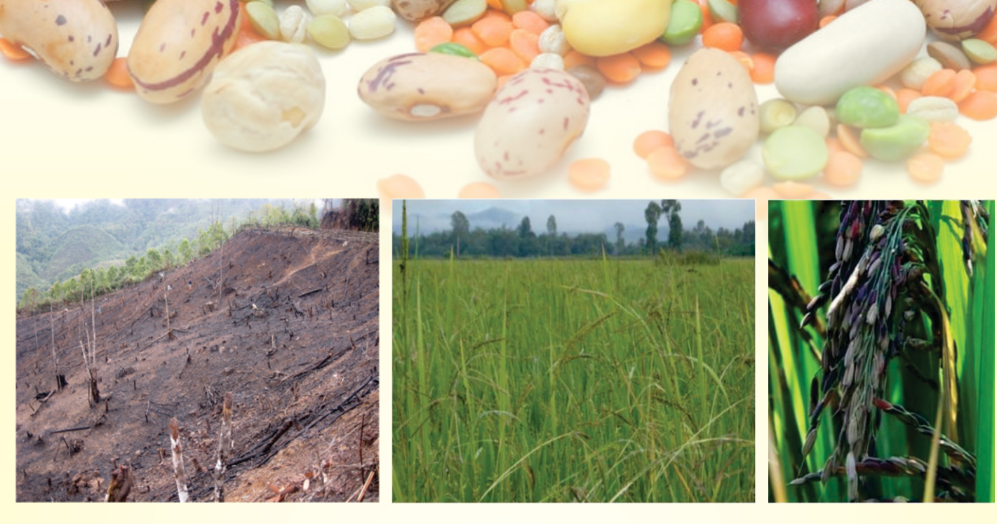
CHALLENGES OF SEED PRODUCTION IN NORTH EASTERN HILL REGION